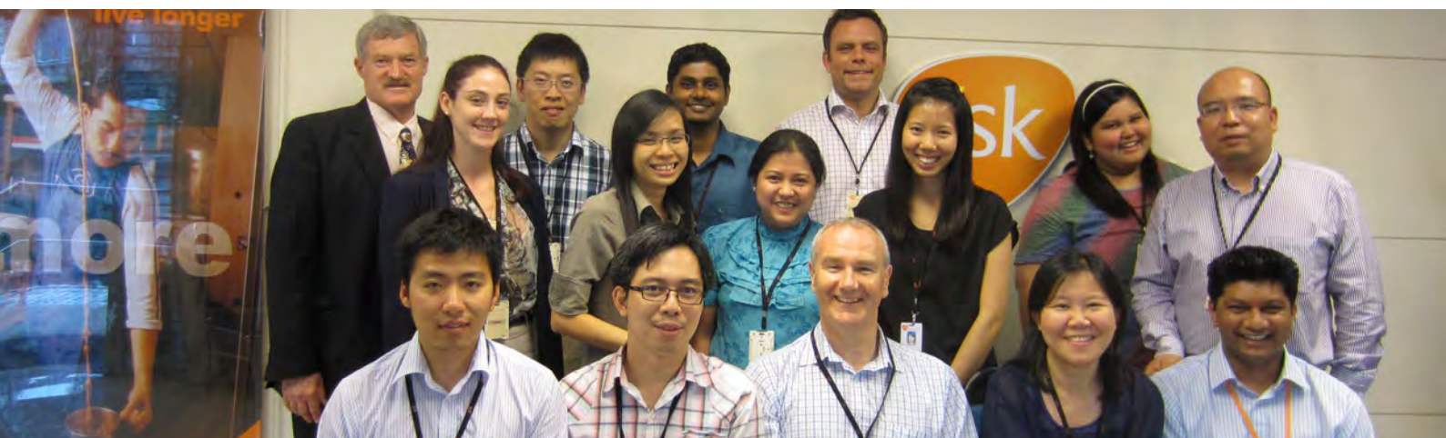
Corporate training with GlaxoSmithKline (GSK) in Kuala Lumpur