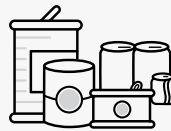
Metal & Aluminum