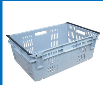
47 Lt Swing Bar Crate