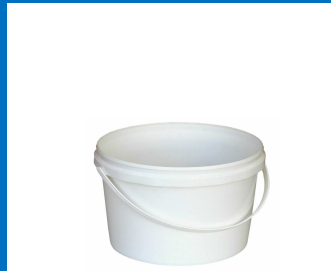
4 Lt Round Pails