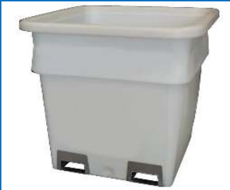
800-1340 Lt ROTA Bins