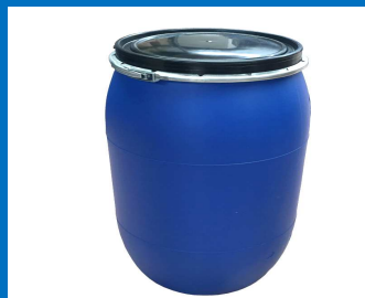
Open Head Drums