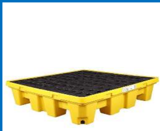
265 Lt Spill Pallet - 4 Drum