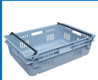
35 Lt Swing Bar Crate