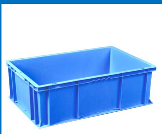
5-54 Lt Stackable Tote Boxes