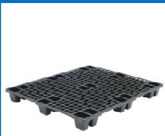
Nestable EXPORT Pallets