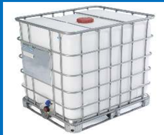
Rigid 500 & 1000 Lt IBC's