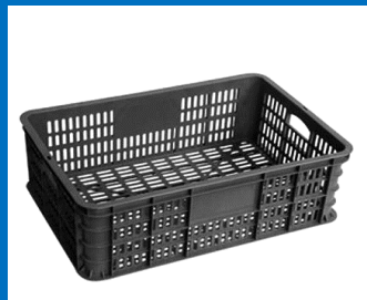
40 Lt Vented Stackable Crate