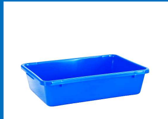
23 Lt Nesting Crate