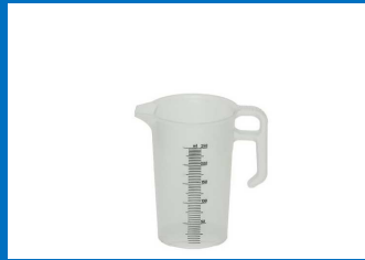
250ml Measuring Jug