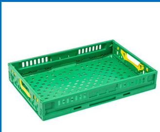
23 Lt Foldable Produce Crate