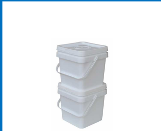
5 Lt Square Pails