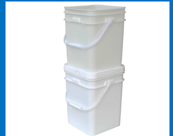
20 Lt Square Pails