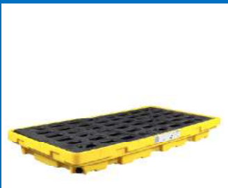
80 Lt Spill Deck