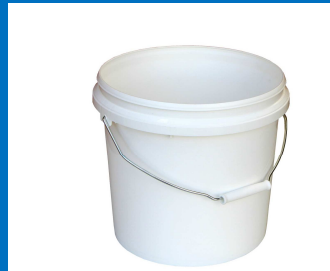
10 Lt Round Pails