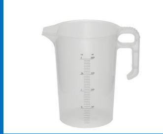
3 Lt Measuring Jug