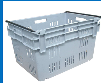
75 Lt Swing Bar Crate