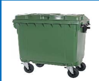
4 Wheeled MGB's