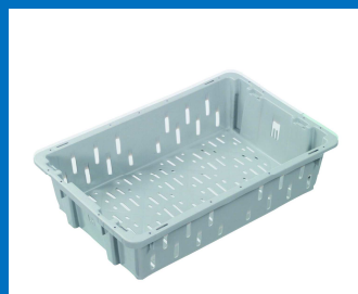
Primary Processing Crates