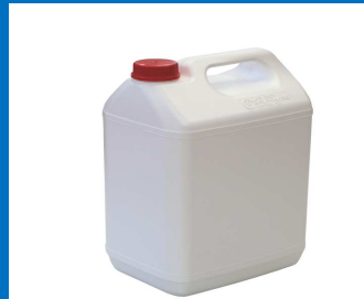
5 Lt Jerry Cans