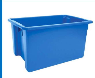
68 Lt Stack N Nest Crate