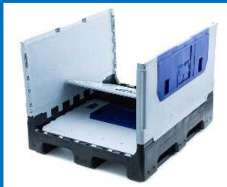
840 Lt Solid Foldable Bin