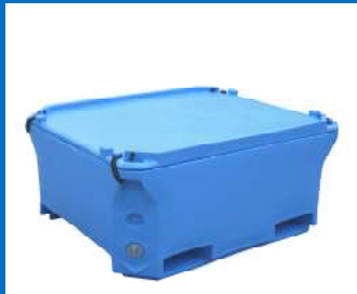
460 Lt Insulated Pallet Bin