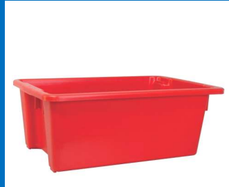
52 Lt Stack N Nest Crate