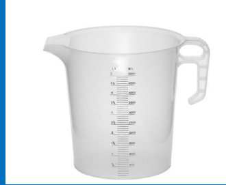
5 Lt Jerry Can