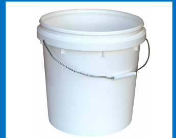
20 Lt Round Pails