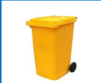
2 Wheeled MGB's