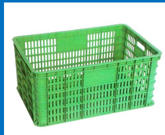
60 Lt Vented Stackable Crate