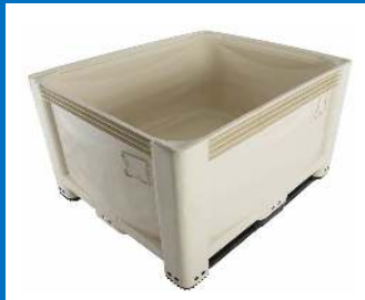
675 Lt MEDIUM Duty Pallet Bins