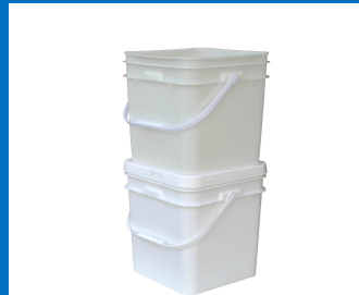
15 Lt Square Pails