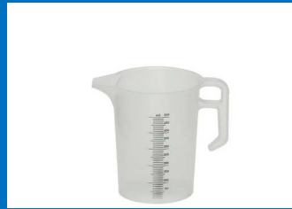
500ml Measuring Jug