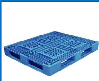
Rackable GENERAL Pallets