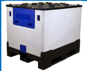
Foldable 1000 & 1250 Lt IBC's