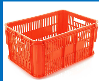
65 Lt Vented Stackable Crate