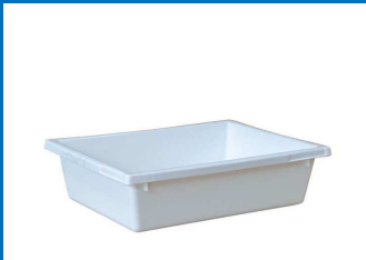
13 Lt Nesting Crate