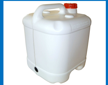
20 Lt Jerry Cans