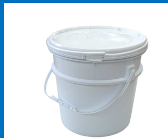
DG Screw Top Pails