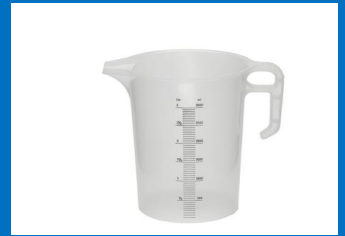
1 Lt Measuring Jug