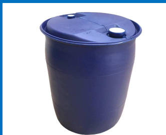
Closed Head Drums