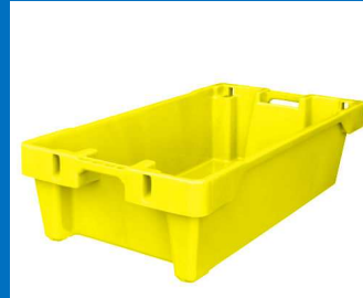
45 Lt Fish Case