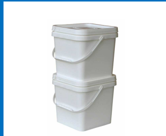
10 Lt Square Pails