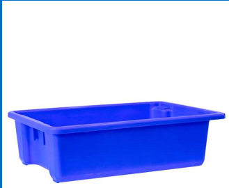
32 Lt Stack N Nest Crate