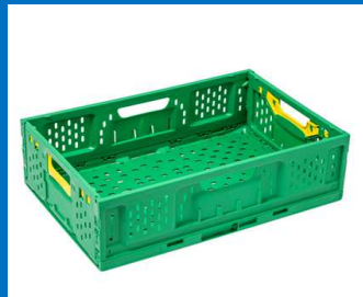
39 Lt Foldable Produce Crate