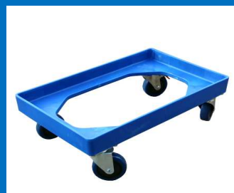
Crate Skates & Castor Range