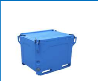
310 Lt Insulated Pallet Bin