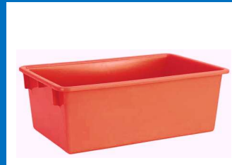
40 Lt Nesting Crate