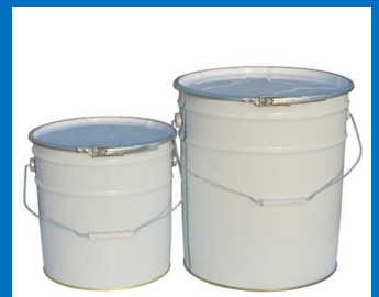
STD & DG Tin Plate Pails

COPACK HAS A FULL RANGE OF MATERIALS HANDLING EQUIPMENT FEATURING PALLET TRUCKS, TROLLEYS, WHEELIE BINS AND THESE ARE BACKED UP BY A FULL RANGE OF WHEELS AND CASTORS TO GET YOU MOVING. PLEASE CONTACT YOUR COMPANY REPRESENTATIVE OR OUR CUSTOMER SERVICES TEAM FOR MORE DETAILED INFORMATION, OR FOR PRICING AND AVAILABILITY. WE CAN DELIVER COST EFFECTIVELY NATIONWIDE.