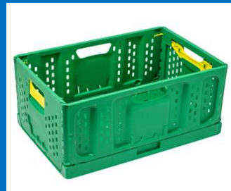
60 Lt Foldable Produce Crate