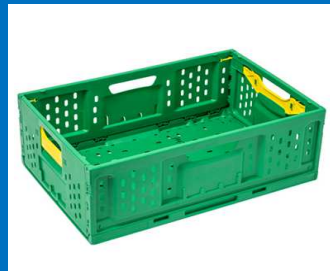
47 Lt Foldable Produce Crate