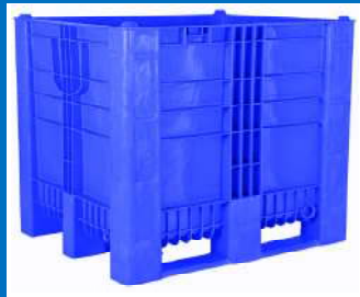
1000 Lt HEAVY Duty Pallet Bins