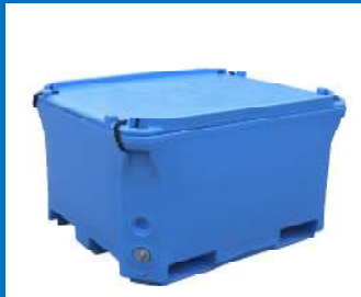
660 Lt Insulated Pallet Bin