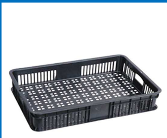
20 Lt Vented Stackable Crate