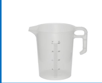
2 Lt Measuring Jug