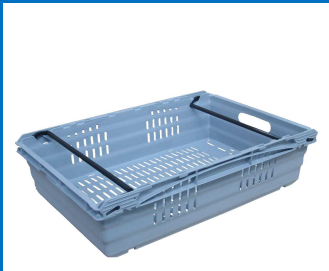
23/28 Lt Swing Bar Crate