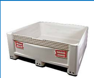
562 Lt MEDIUM Duty Pallet Bins

COPACK INDUSTRIAL PACKAGING LTD SPECIALISES IN PROVIDING INDUSTRIAL PLASTIC PACKAGING AND MATERIAL HANDLING PRODUCTS COMPLIMENTED BY A RANGE OF HANDLING EQUIPMENT AND CASTORS TO KEEP YOU MOVING. WE BLOW MOULD JERRY CANS AND DRUMS IN OUR HAMILTON FACTORY AND BACK THESE LOCALLY MADE PRODUCTS UP WITH QUALITY PRODUCTS SOURCED NATIONALLY AND INTERNATIONALLY THAT MEET OUR STRICT CRITERIA. THIS BROCHURE SHOWCASES A SECTION OF OUR ENTIRE PRODUCT RANGE THAT IS INDUSTRY SPECIFIC AND IS NOT A COMPLETE REPRESENTATION OF ALL PRODUCTS AVAILABLE. WE HAVE A NEW WEBSITE THAT FEATURES MOST OF OUR PRODUCTS BUT PLEASE CONTACT US TO DISCUSS ANY PRODUCT REQUIREMENT NOT SHOWN - 0800 4 COPACK