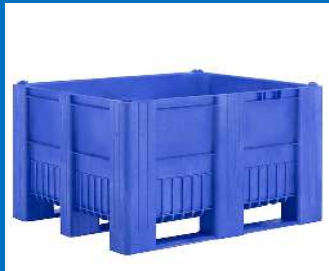
620 Lt HEAVY Duty Pallet Bins