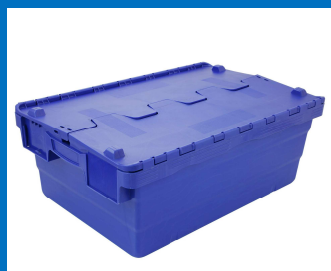
20 - 60 Lt Security Crates