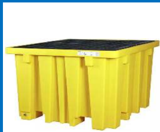
1130 Lt Spill Pallet - IBC