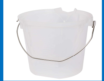
10 & 20 Lt Calibrated Pails