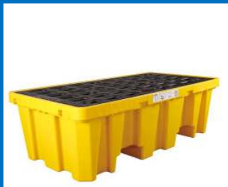
220 Lt Spill Pallet - 2 Drum