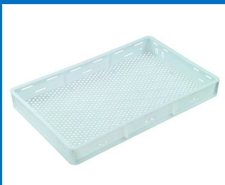
Solid & Vented Trays