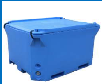
1000 Lt Insulated Pallet Bin