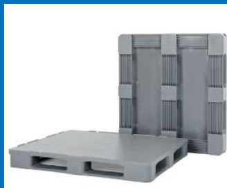
Rackable HYGIENE Pallets