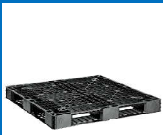
Rackable EXPORT Pallets