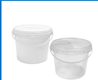
0.5 - 5 Lt Round Tab Pails