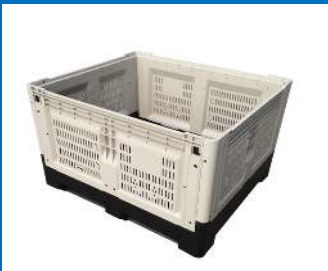
700 Lt Vented Foldable Bin